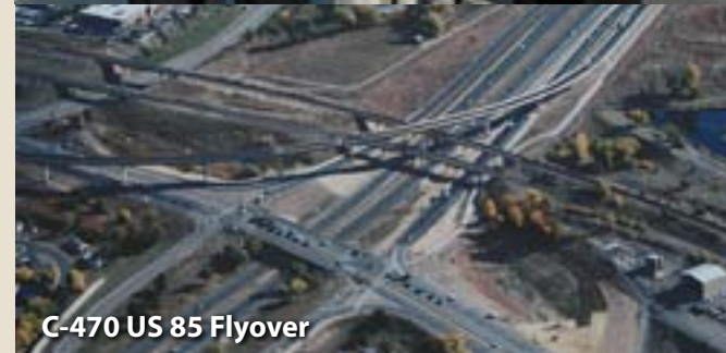
C-470 US 85 Flyover