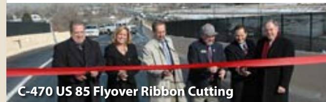
C-470 US 85 Flyover Ribbon Cutting