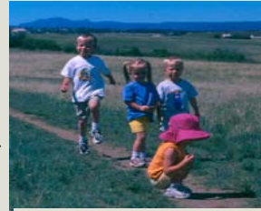
Young explorers enjoy the Glendale Farm Trail.

Glendale Farm Open Space is a truly valuable community resource that preserves scenic views and provides a natural buffer between rapidly developing Lone Tree, Castle Pines, and Castle Rock. Visitors at the top of the trail get a feel for the