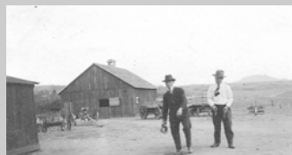
Early games at Kroll farm included horseshoes.