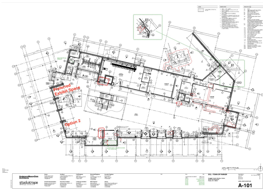
Figure 5: Parker branch preferred exhibit space with optional expansion for certain exhibits.

Two locations have been identified as optimal, 1) near the front entrance, 2) recessed area further south along the wall near the young adult section. Either may work dependent on content and targeted audiences