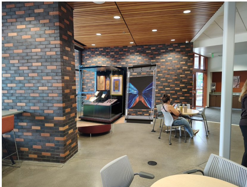
Figure 6: Parker branch preferred option 1 for exhibits cases with rendered cases.