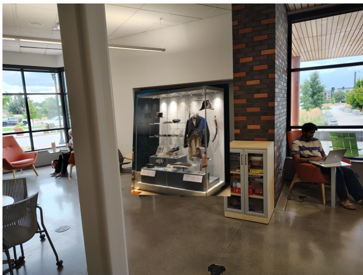
Figure 7: Optional exhibit space with exhibit space rendered.