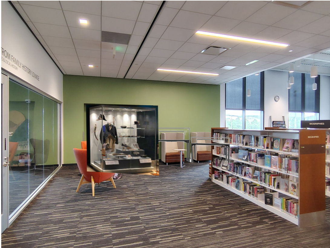
Figure 2: Castle Rock preferred exhibit space with rendered possible exhibit cases placements.